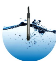
MINIATURE BORE HOLES