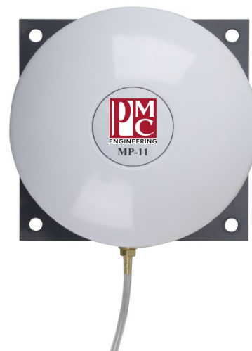
Figure 3: MP 11 zero maintenance moisture protection reference volume

The cable termination at the wellhead is also important, not only to provide a connection for onward transmission, but also to facilitate an outlet for the breather tube to atmospheric pressure. This is vital to ensure the correct operation of the transmitter which would otherwise be affected by changes in barometric pressures. This reference breather tube must be protected from ingress of moisture to enhance the long term reliability of the transmitter. There are many techniques for this, such as the use of desiccant within the termination enclosure.