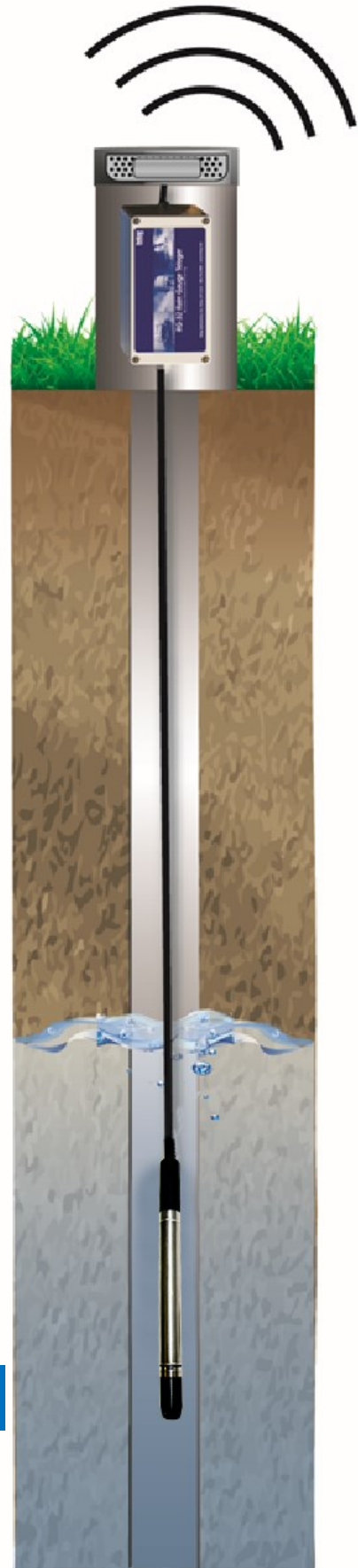
Figure 5: MTM3000 located in aquifer and PR-32 pressure recorder at well head with wireless communication

The high integrity well developed submersible pressure transmitters of today provide very reliable, zero maintenance, level monitoring and pump control for deep well applications. These hydrostatic level measuring transmitters are continually monitoring the water level, and with the enhancements in the associated control systems, provide valuable information related to the environment. Through the addition of products such as the MP 11 breather termination and PR-32 pressure recorder these level sensors can be installed with anticipated zero maintenance operation for up to 5 years, and then only required a battery change. The high initial accuracy of the transmitter and excellent long term stability provided by the piezoresistive technology also minimizes the need for recalibration, previously considered to be an annual event.