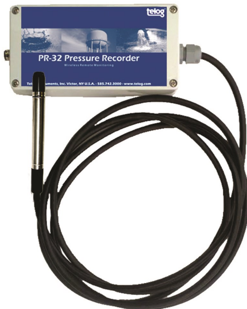
Figure 4: PR-32 pressure recorder connected to MTM3000 level sensor

As previously mentioned, deep wells are often located in remote areas which are not so easy to access. Power to the transmitter can be provided by solar as depicted in Fig. 1. However, with the advancement of battery technology it is becoming more common to use battery powered pressure recorders or data loggers. When coupled to a cellular network a huge amount of time and cost is saved by the user. Manufacturers such as Telog 1 offer a pressure recorder, see Fig. 4.