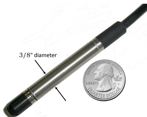
Figure 2: MTM3000 level sensor in titanium laser-welded housing and molded cable termination - 3/8" diameter

The purpose of the level sensor is to provide an electrical feedback to the pressure recorder or data logger and/or pump for monitoring of production wells. Traditionally, floats, tapes and often bubbler systems have also been utilized although the latter create increased maintenance challenges with the requirement of a continual gas flow. Today there are many sensor technologies for measuring liquid level such as radar, ultrasonic and conductive. However, these are either high in price or unreliable due to the operating environment. In recent years, submerged hydrostatic pressure transmitters have been developed to withstand the environmental conditions and provide continuous monitoring for enhancement of the control with increased long term reliability.