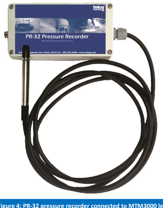
Figure 4: PR-32 pressure recorder connected to MTM3000 level sensor

As previously mentioned, deep wells are often located in remote areas which are not so easy to access. Power to the transmitter can be provided by solar as depicted in Fig. 1. However, with the advancement of battery technology it is becoming more common to use battery powered pressure recorders or data loggers. When coupled to a cellular network a huge amount of time and cost is saved by the user. Manufacturers such as Telog<sup>1</sup> offer a pressure recorder, see Fig. 4.