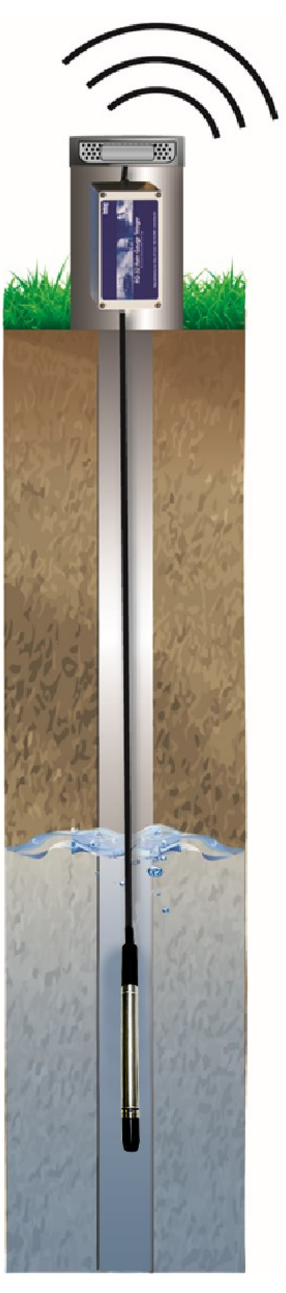
Figure 5: MTM3000 located in aquifer and PR-32 pressure recorder at well head with wireless communication

The high integrity well developed submersible pressure transmitters of today provide very reliable, zero maintenance, level monitoring and pump control for well applications. These hydrostatic deep level measuring transmitters are continually monitoring the water level, and with the enhancements in the associated control systems, provide valuable information related to the environment. Through the addition of products such as the MP 11 breather termination and PR-32 pressure recorder these level sensors can be installed with anticipated zero maintenance operation for up to 5 years, and then only required a battery change. The high initial accuracy of the transmitter and excellent long term stability provided by the piezoresistive technology also minimizes the need for recalibration, previously considered to be an annual event.